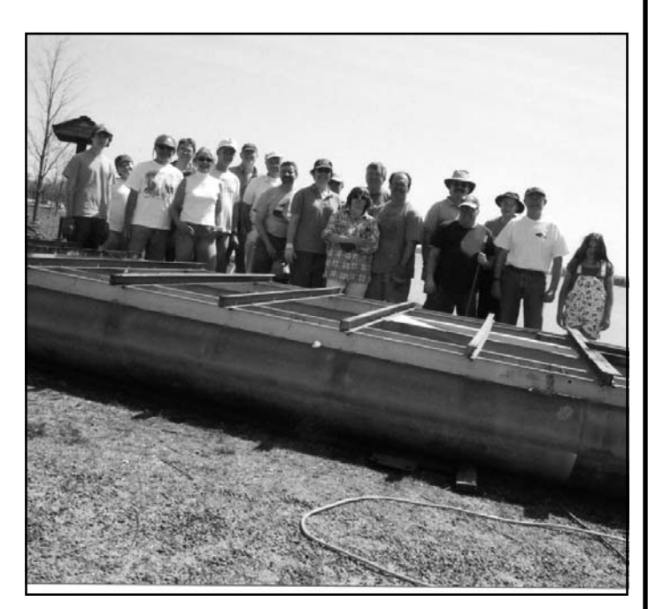
Is it my imagination or are a few parts missing?

Thanks to everyone who helped with the Spring projects to prepare our facilities and boats for the new season. Here a cast of thousands is staring at our race committee boat—See Which Won.