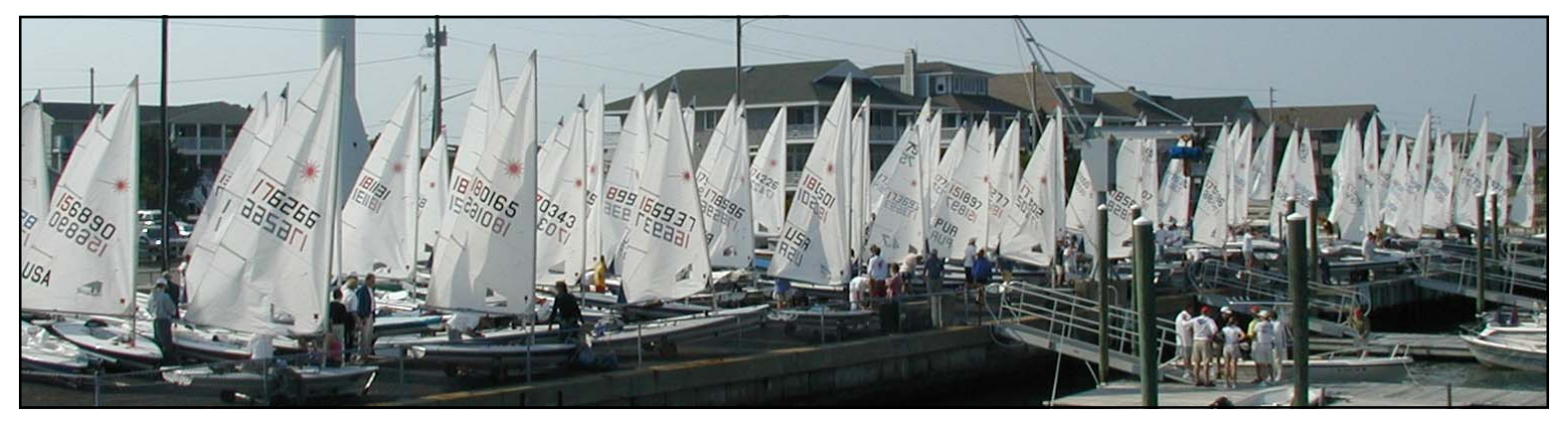
A few of the 157 Lasers that entered the Laser US National Championships at Wrightsville Beach NC on April 21-24